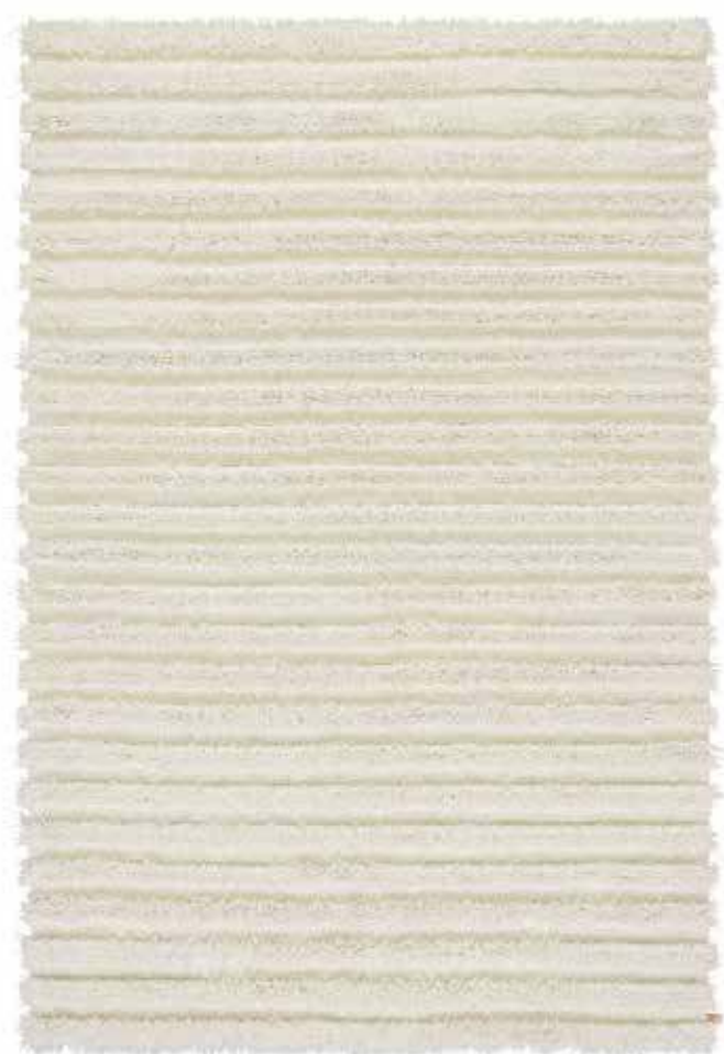
Rug 170 x 240 cm, Ghost 880