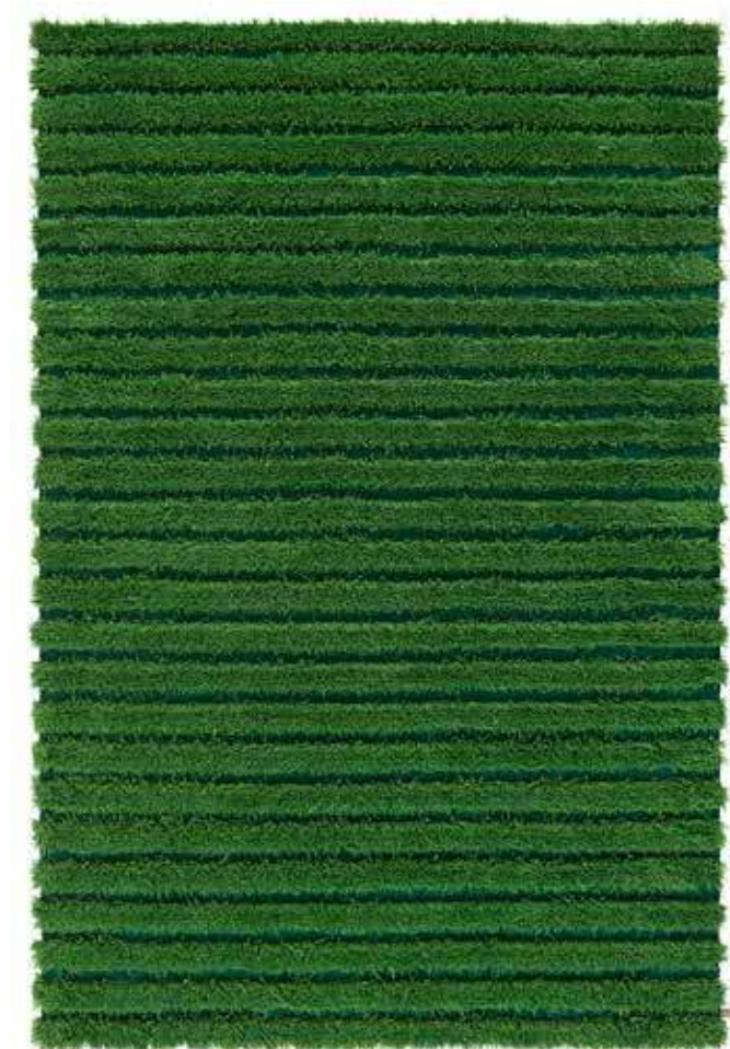
Rug 170 x 240 cm, Jungle 330