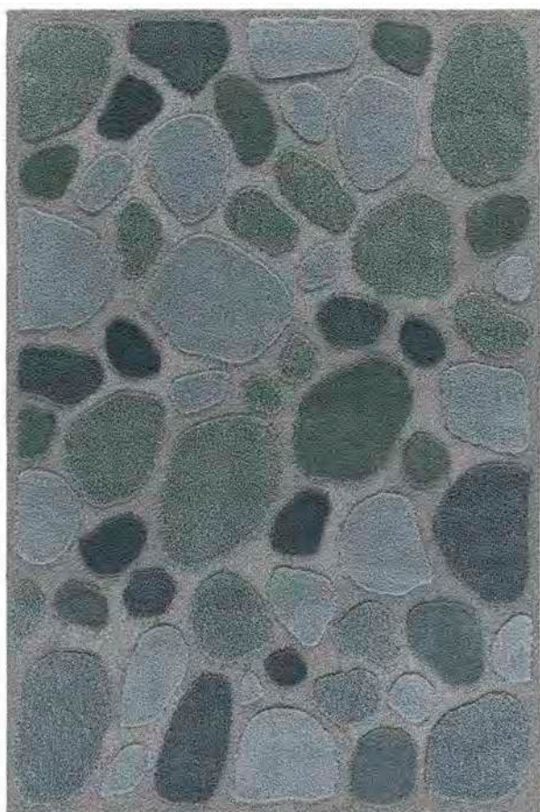
Rug 170 x 240 cm, March 200