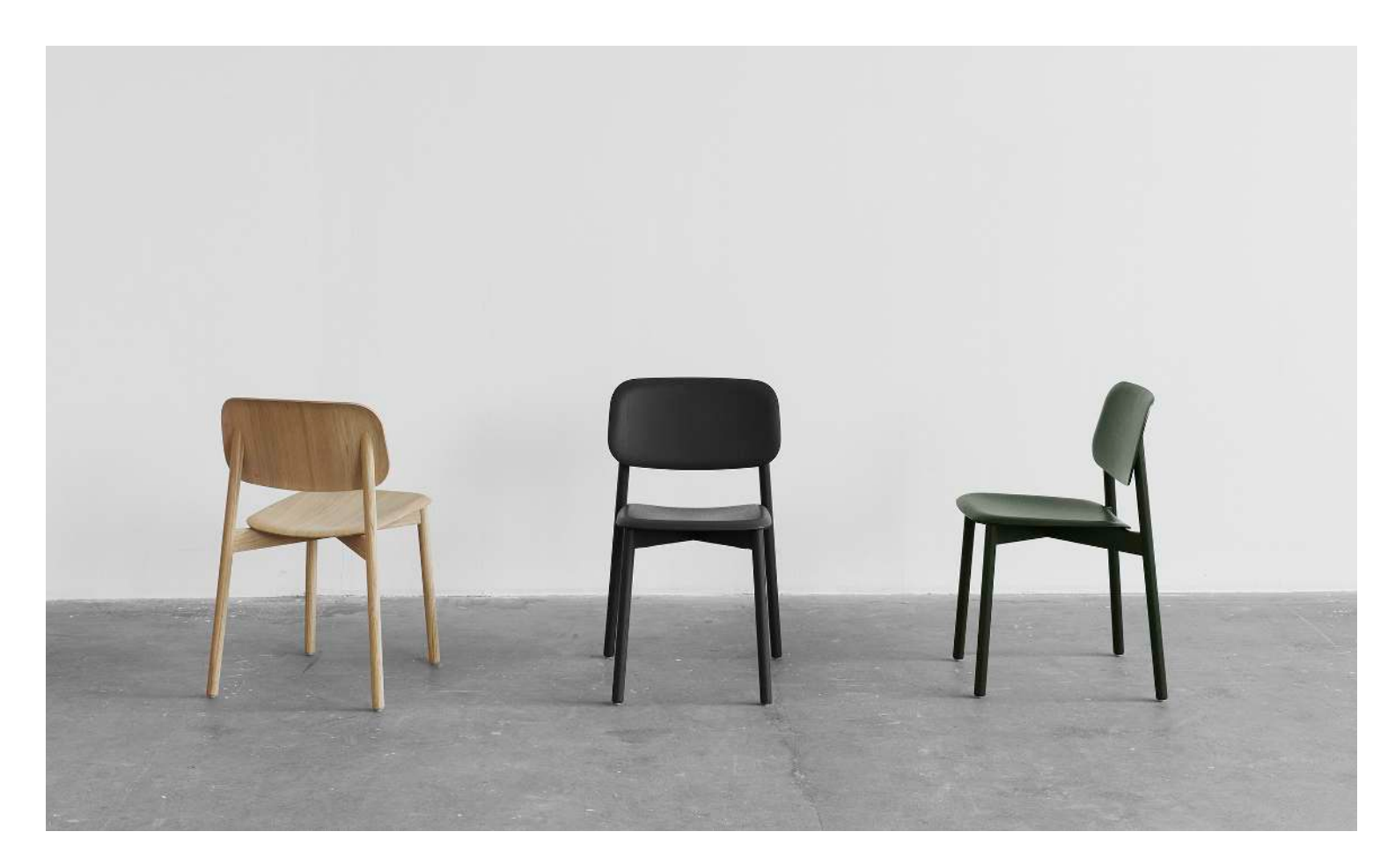
Soft Edge, wood base