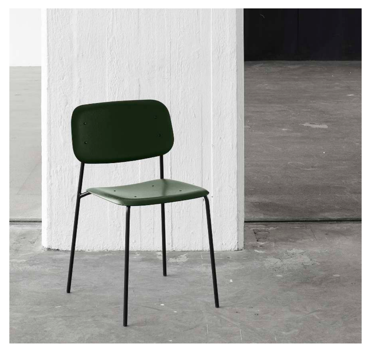
Soft Edge, steel base